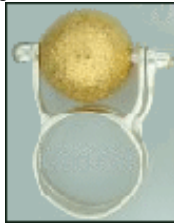
This is the Burgard Bead Ring!